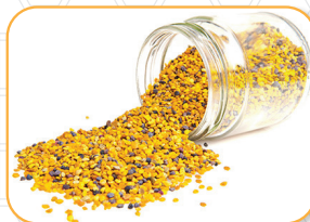
Bee pollen ပန်းဝတ်မှုန့်