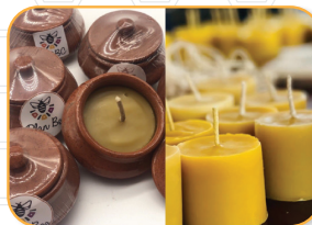
Bee Wax Candles ပျားဖယောင်း