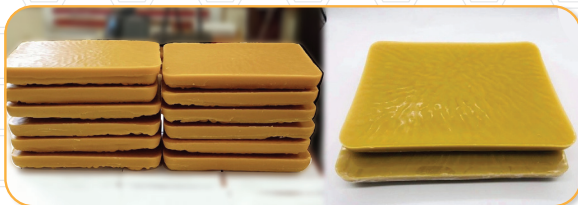
Pure Bee Wax သန့်စင်ပြီး ပျားဖယောင်း