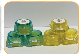
Bee wax balm ပျားလိမ်းဆေး