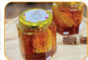
Honey Comb ပျားသလက်