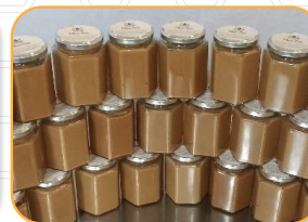
Spreadable Halva 100% Natural နှမ်းပျားရည်