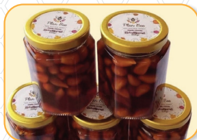
Garlic Honey and Garlic Honey Paste ကြက်သွန်ဖြူပျားရည်နှင့် ကြက်သွန်ဖြူအနှစ်